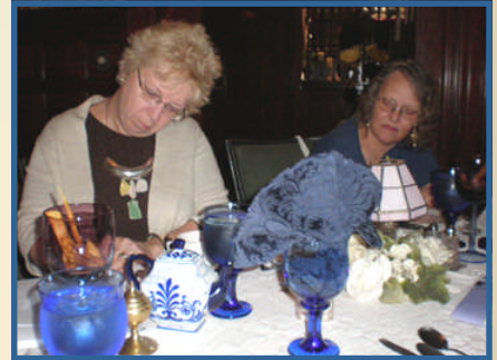
Retiree's Friday Lunch Bunch